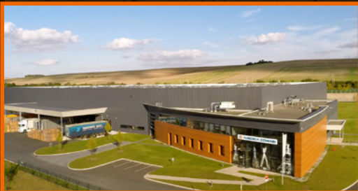
Ailly-sur-Noye production site