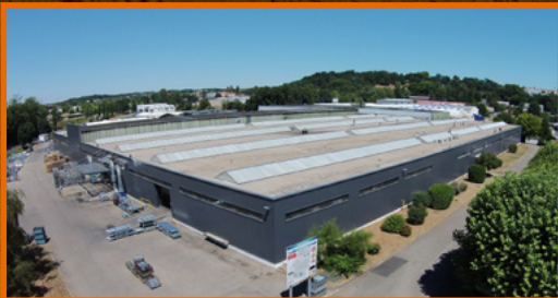
Trévoux production site