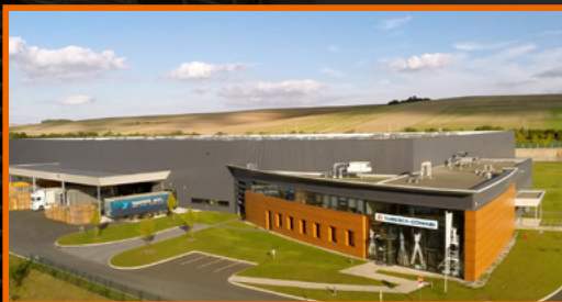
Ailly-sur-Noye production site