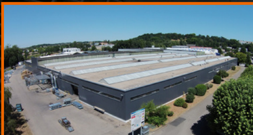
Trévoux production site